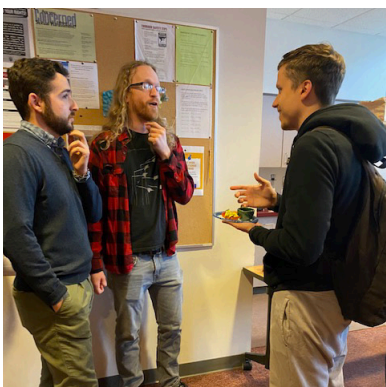
Special teas like this provide a space for faculty and students to come together in a friendly, supportive environment to build connections and have conversations.